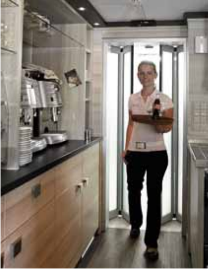
Automatic Gilgen folding door FFM for the maximum possible opening, even when space is limited.

The complete range of selectable functions and available control and safety elements enables you to find the optimal solution for your situation.